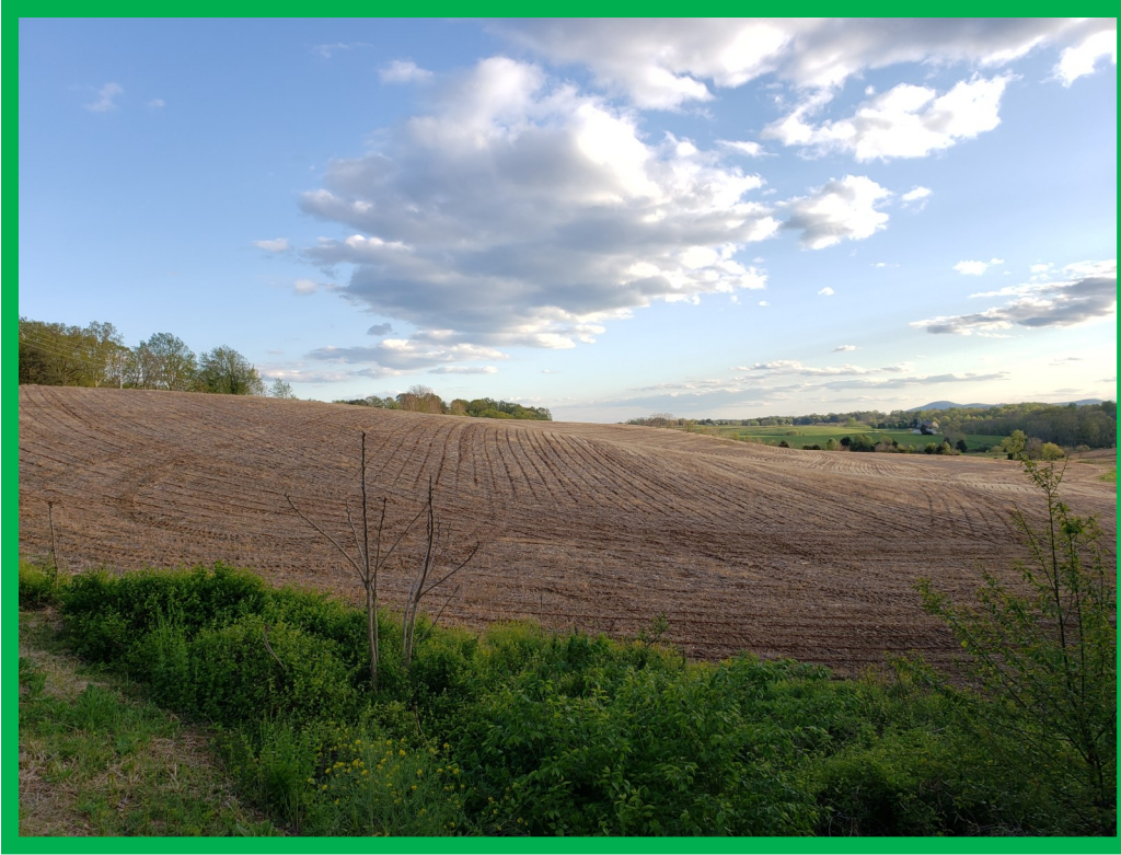
VIEW OF PROPERTY LOOKING SOUTH