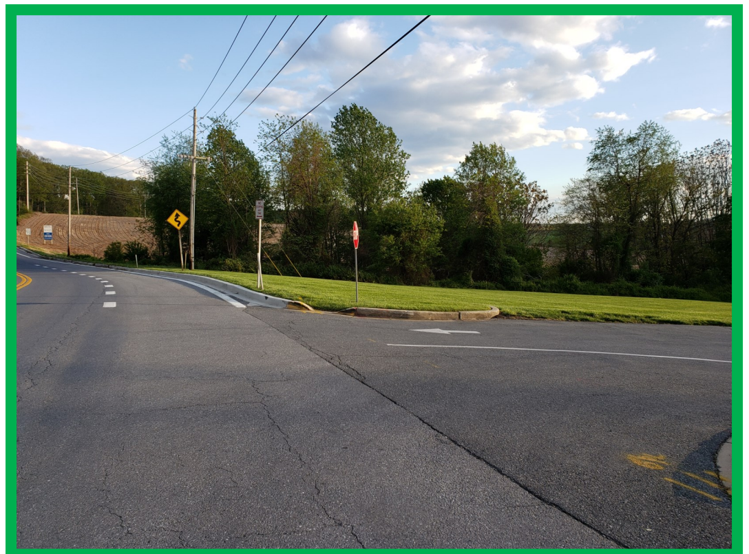
EXISTING COMMON ENTRANCE FROM GREEN VALLEY RD

Disclaimer: Information obtained from sources deemed to be reliable. However, we make no guarantee, warranty or representation. Information, prices, and other data may change without notice.